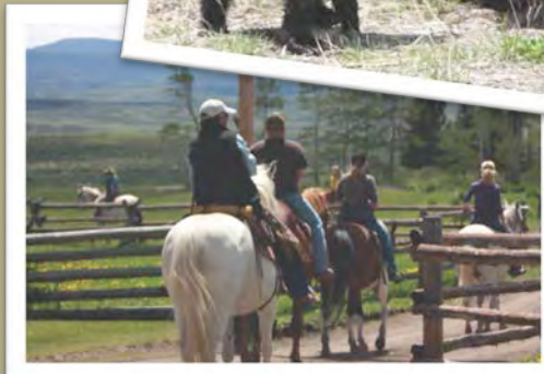
Up-to-date news & photos: